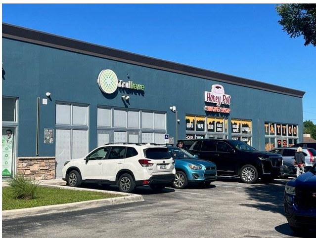
Figure 6: Site Photos – October 17, 2023