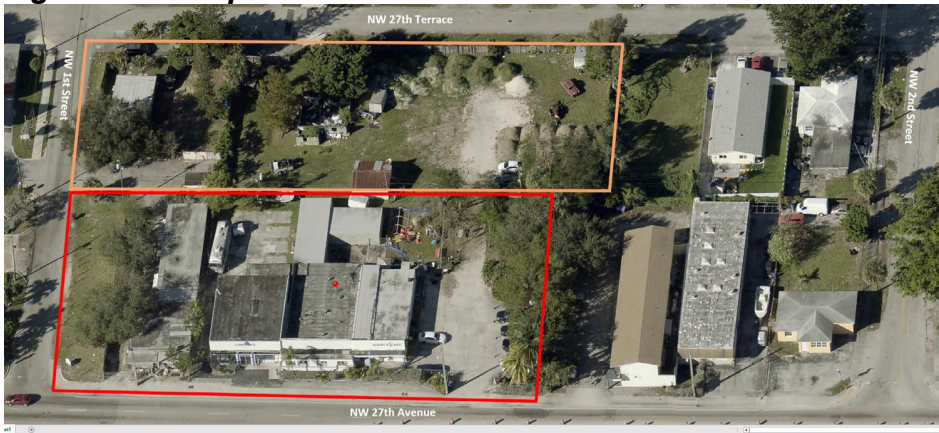
Figure 3: Oblique Site View from the East