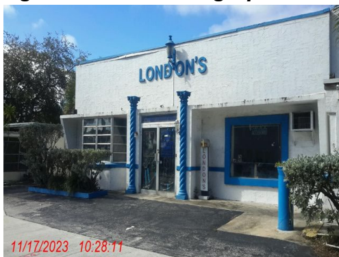
Figure 4: Site Photographs