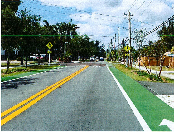
Continuous Green Bike Lane (Two-Part Textured/Reflective Surface) [Maintained by Municipality]