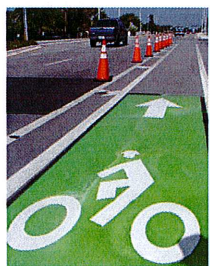
Pre-formed Bike Symbol On Green Background