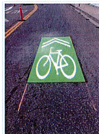
Pre-formed “Sharrow” On Green Background