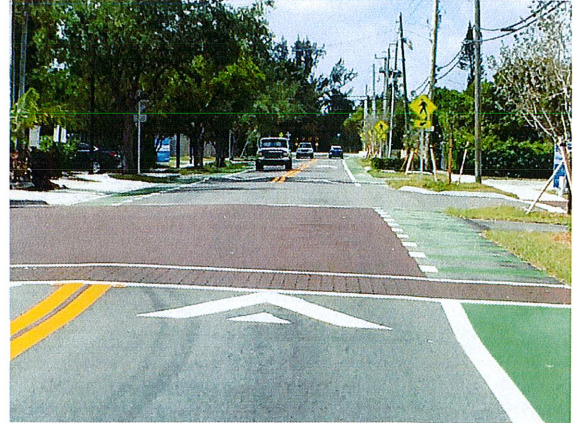
Continuous Green Bike Lane @ Cross-Street (Two-Part Textured/Reflective Surface) [Maintained by Municipality]